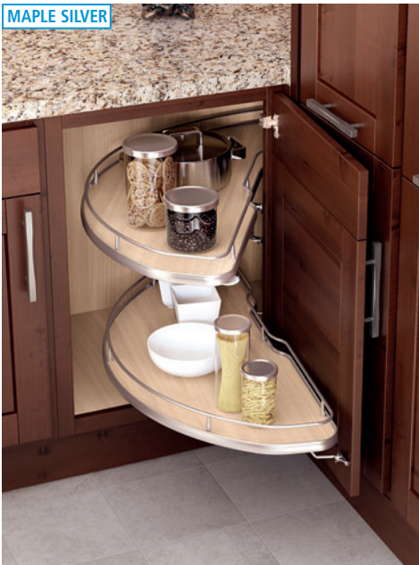
Maple shelves, silver rail, left opening